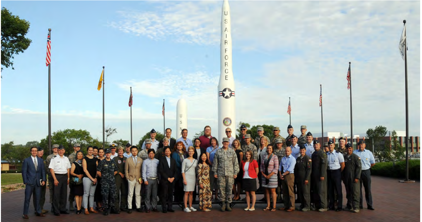
Gen John Hyten, Commander, U.S. Strategic Command, welcomed the 2017 Experience Day participants, which included international government and military dignitaries from nine nations and members from multiple Academic Alliance institutions.