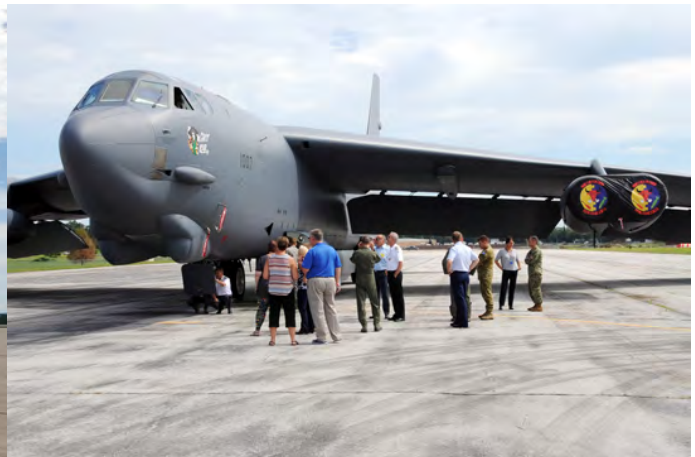
B-52 Bomber from the 5th Bomb Wing (Minot AFB, ND)