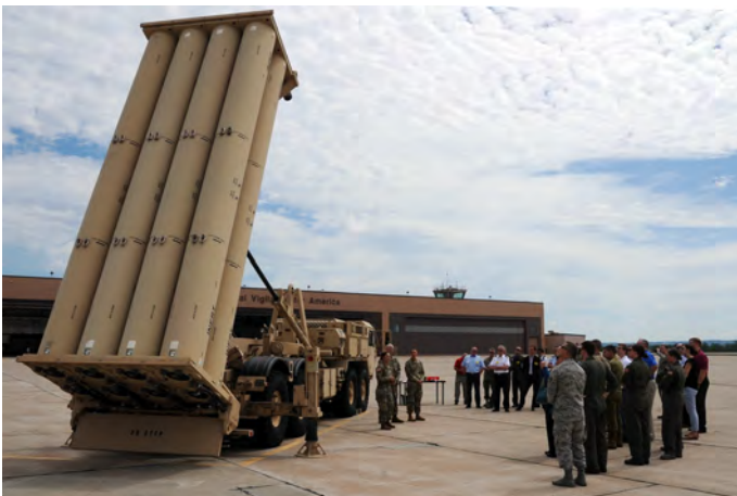
THAAD Launcher from the Army Air Defense Artillery School (Ft Sill, OK)

USSTRATCOM Experience Day (28 Jul 17). Academic Alliance professors and students joined military and government officials from the UK, Canada, Australia, New Zealand, France, Germany, Poland, Denmark, and Japan at Offutt AFB to get a close-up look at the assets the U.S. relies on to operationalize deterrence. The group toured the USSTRATCOM Global Operations Center, followed by a close-look and aircrew briefings at a B-52 strategic manned bomber, an OC-135 Open Skies Treaty aircraft, and an E-6B Airborne Command Post/ICBM Airborne Launch Control System aircraft. The tours also included a THAAD (Terminal High Altitude Area Defense) launcher from the Army Air Defense Artillery School at Ft. Sill, Oklahoma.