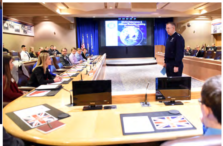
Gen Hyten Addressing DA3 TTX Participants