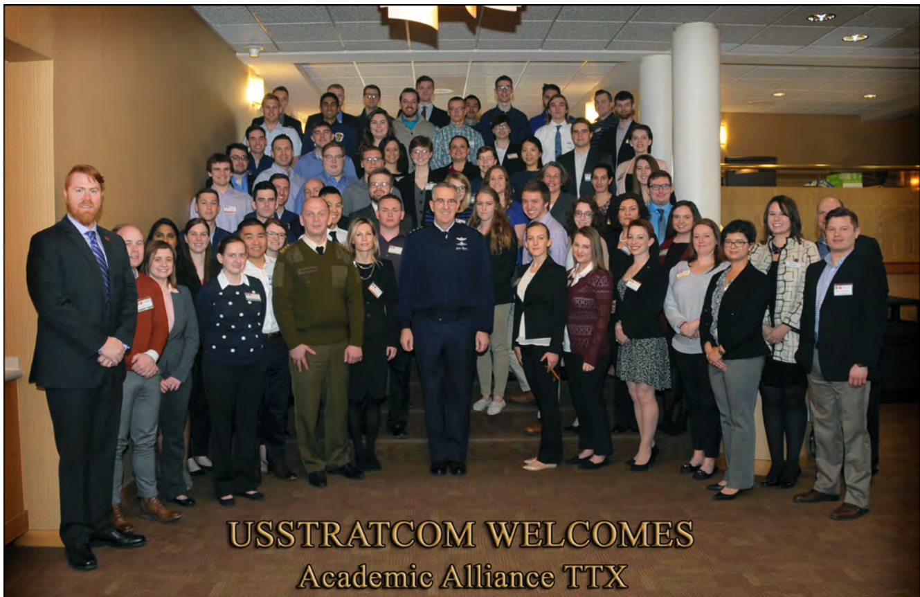
Gen Hyten with DA3 TTX Participants and Mentors

Academic Alliance Conference and TTX 2018 (15-16 Mar). The third annual Deterrence and Assurance Academic Alliance Conference was hosted by University of Nebraska at Lincoln College of Law. The first day of the conference, students and faculty from seven countries and over a dozen DA3 member institutions participated in a table top exercise at Offutt Air Force Base. Before the exercise, Gen Hyten, Commander USSTRATCOM, gave an overview of the Command's priorities and the importance of allies and partners to deterrence and assurance. Students engaged on a scenario involving Russian invasion of Latvia to learn about alliance dynamics during a crisis. Nine teams of students, representing various countries within NATO, analyzed their respective country objectives and negotiated with other teams in relation to whether the alliance could reach consensus on declaring Article V. DA3 faculty members and USSTRATCOM staff provided mentorship to the TTX teams.