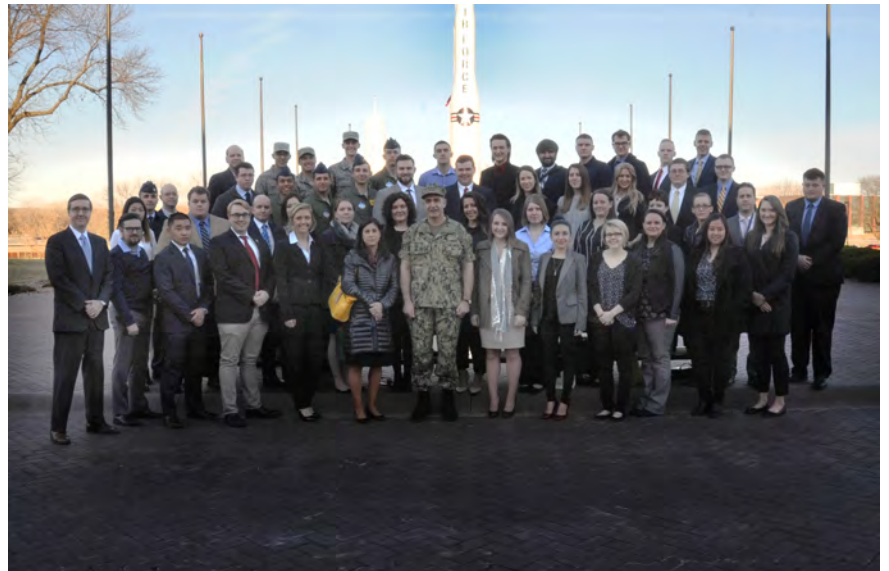
Vice Admiral Charles "Chas" Richard (center, front row), Deputy Commander of USSTRATCOM, with members of the 2017 DA3 Conference & Workshops prior to the table top exercise at STRATCOM Headquarters

The second annual Academic Alliance Conference was a huge success. Creighton University provided a first-class venue, and the selection of keynote speakers, panelists, and workshop leaders made for an event where even the most seasoned deterrence practitioner could gain fresh perspectives on how to approach the national security problems of today. The senior staff at USSTRATCOM thanks all involved with producing this success, from event planners to presenters, and the very active and engaged audience. We are planning to hold next year's conference at the University of Nebraska-Lincoln. Stay tuned for details as planning matures and we issue the "call for proposals."