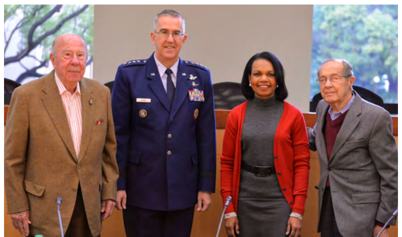
General John E. Hyten, Commander of USSTRATCOM, with Secretary George P. Shultz, Secretary Condoleezza Rice, and Secretary William J. Perry at the Center for International Security and Cooperation, Stanford University

Gen Hyten Addresses Stanford University's Center for International Security and Cooperation (CISAC) (24 Jan 17). The USSTRATCOM Commander engaged in a roundtable discussion with CISAC directors, Hoover Institution Distinguished Fellow Secretary George P. Shultz, and Senior Fellows Secretary Condoleezza Rice, Secretary William J. Perry, and Ambassador Michael A. McFaul. He also received individual deterrence and assurance related briefings by Stanford faculty members, and engaged in open discussions with CISAC research fellows. Gen Hyten gave a public talk titled " U.S. Strategic Command Perspectives on Deterrence and Assurance ," and stressed that discussions like these must always take place, even where there is disagreement.