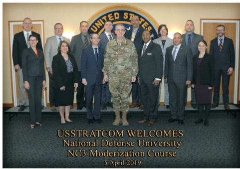
Gen John Hyten, USAF, Commander, USSTRATCOM (center) with faculty and students