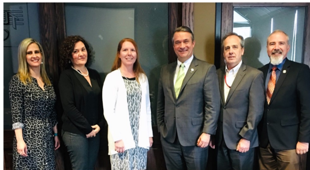
Congressman Don Bacon (center-right) with representatives from UNO and USSTRATCOM