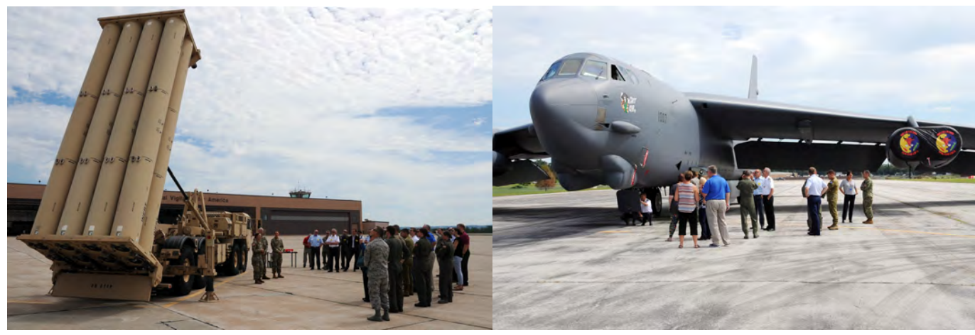
THAAD Launcher from the Army Air Defense Artillery School (Ft Sill, OK)

USSTRATCOM Experience Day (28 Jul 17). Academic Alliance professors and students joined military and government officials from the UK, Canada, Australia, New Zealand, France, Germany, Poland, Denmark, and Japan at Offutt AFB to get a close-up look at the assets the U.S. relies on to operationalize deterrence. The group toured the USSTRATCOM Global Operations Center, followed by a close-look and aircrew briefings at a B-52 strategic manned bomber, an OC-135 Open Skies Treaty aircraft, and an E-6B Airborne Command Post/ICBM Airborne Launch Control System aircraft. The tours also included a THAAD (Terminal High Altitude Area Defense) launcher from the Army Air Defense Artillery School at Ft. Sill, Oklahoma.