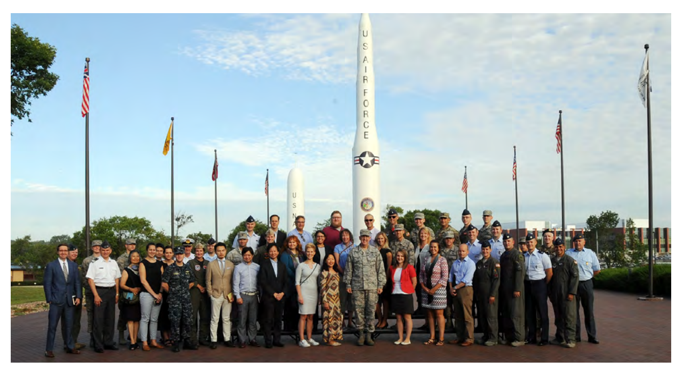
Gen John Hyten, Commander, U.S. Strategic Command, welcomed the 2017 Experience Day participants, which included international government and military dignitaries from nine nations and members from multiple Academic Alliance institutions.